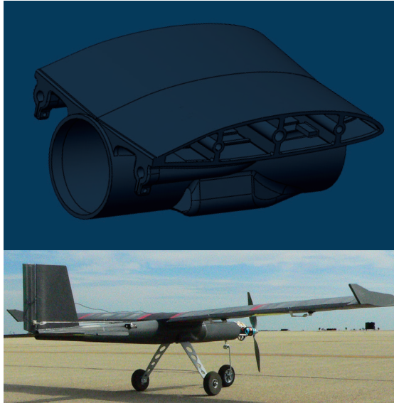
SelectTech Geospatial engineers perfected this drone through many iterations. Test flights were executed with functional prototypes made on an additive manufacturing system.

industry for end-use parts, typically low-volume manufacturing but a mix of many products. For example, in the business-jet community, they may build 500 jets for 50 different customers. Each of those 50 customers is going to say, “I want my cockpit to look like this. I want my cabin to look like this.” And AM end-use parts give them the economies of scale. That flexibility to meet the needs of this wide product mix is really catching on within the general aviation community.