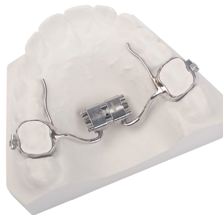
RPE Appliance: Digital dentistry and 3D printing allows for shortened appointment frequency when fabricating an arch expander.

Another benefit of digitization and 3D printing – specifically for the orthodontists and general practitioners performing orthodontic