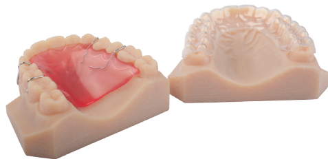
Assurance Retainer System: With the use of 3D printed models, orthodontic appliances like acrylic retainers and/or clear aligners can be easily and efficiently fabricated.

Digital technology decreases costs, workloads and human errors by automating the dental model