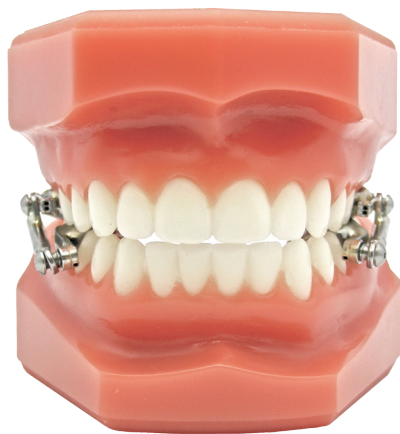
Herbst Appliance: This appliance is used to correct the anterior to posterior relationship of the maxillary and mandibular jaw, a relationship that can be established correctly and easily with digitization and 3D printing.

ACHIEVE OPTIMAL PERFORMANCE THROUGH DIGITIZATION