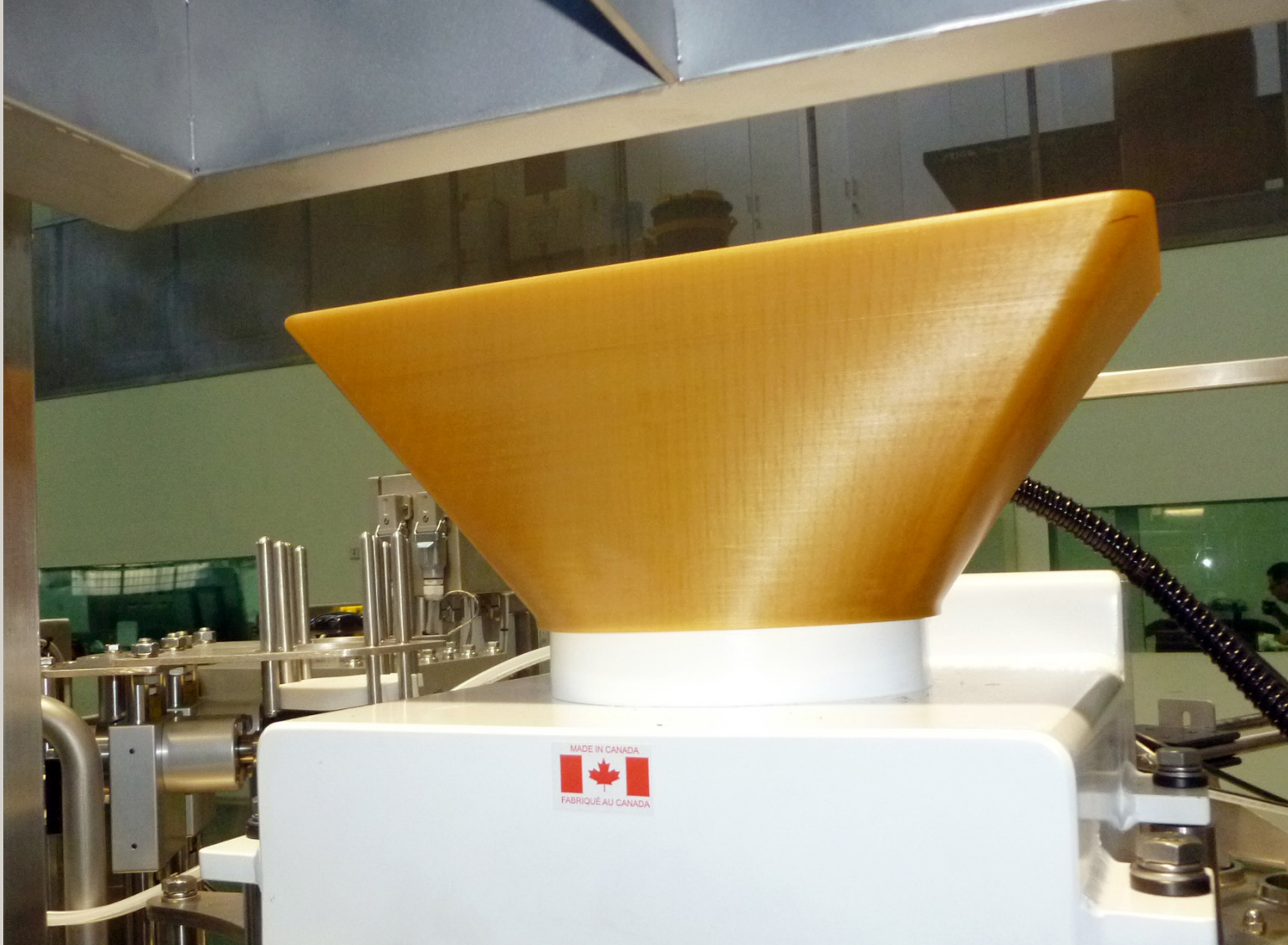
This 3D printed food packaging machine replacement part was 3D printed in ULTEM™ 1010 resin material on the Fortus 450mc 3D Printer.