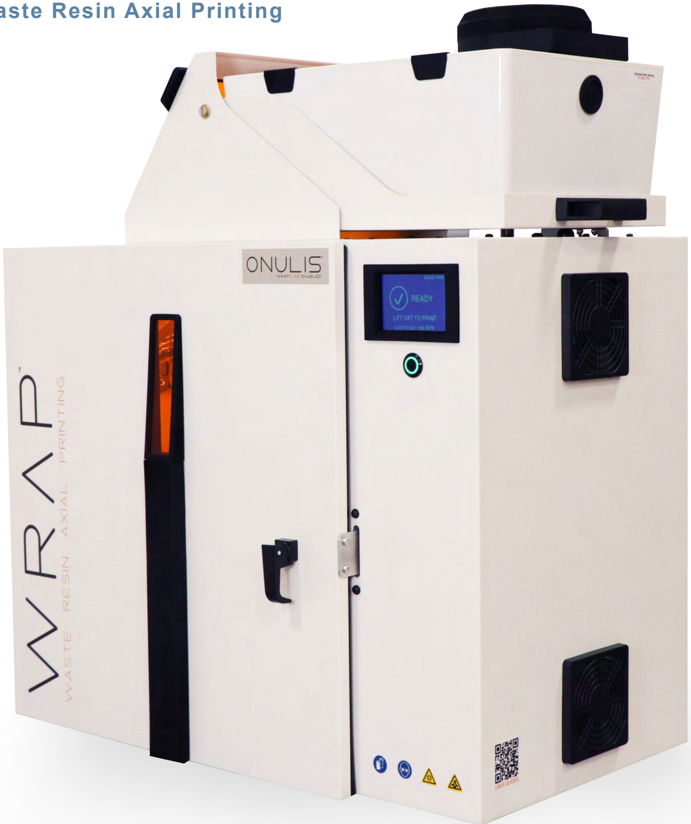
Optional WRAPCure Production DLP Curing Module Pictured Above