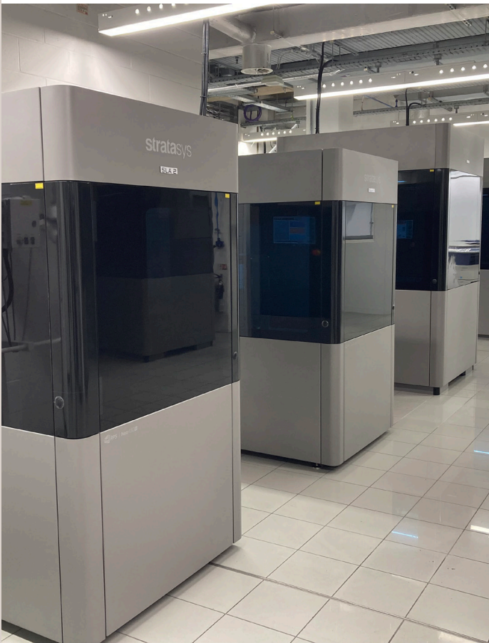
Using its Stratasys Neo800 3D printers, the McLaren F1 Team produces around 9,000 stereolithography parts per year

This improved speed and lower cost makes it easier to run a responsive feedback loop where new iterations can be produced in response to design issues at any point in the season. With its Neo800s, McLaren can create new parts without the need for re-machining tooling blocks or carbon fiber molds – all of which are time consuming and costly processes.