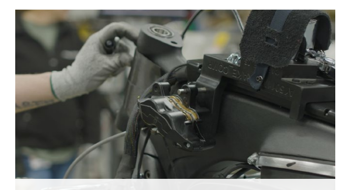
VIN labels guard