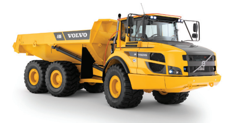
A Volvo A30G Articulated Hauler.