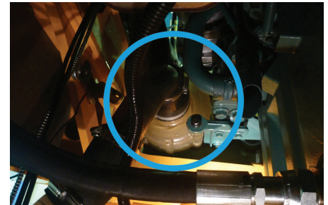
Water pump installed in an A30G for functional testing.